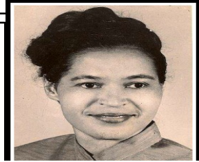
Rosa Parks as a teenager.

Rosa Parks was born on 4 th February 1913 in Alabama USA. She was a small, quiet girl who lived on a farm with her parents and grandparents. Rosa Parks was a seamstress but she also worked to spread the word about civil rights .