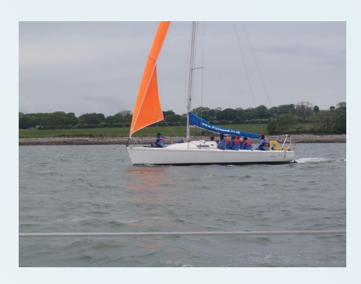
Activities may change according to weather conditions