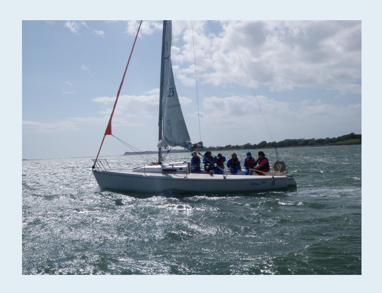
Monday 20<sup>th</sup> May to Friday 24<sup>th</sup> May